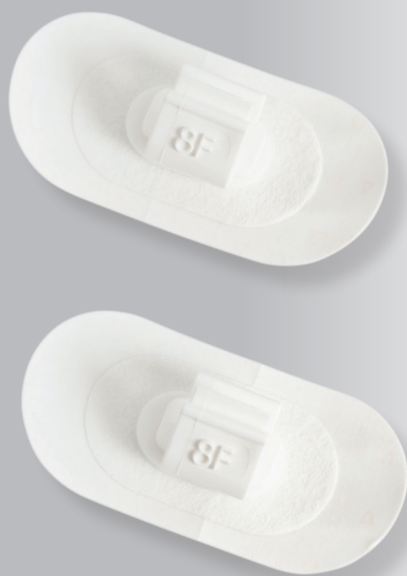
ANCORIS* Tube Anchor Set